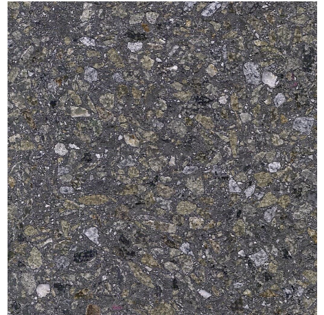
OUTDOOR FINISH SANDBLASTED